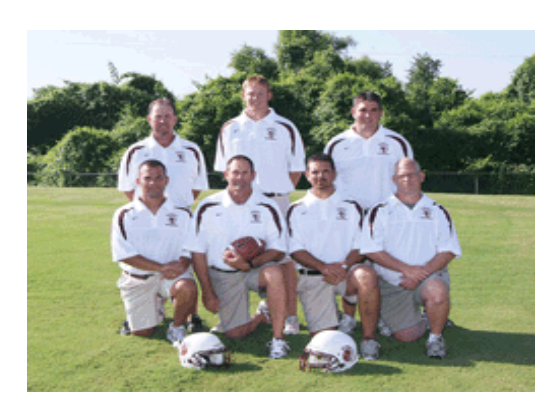
THE 2007 IRONHEADS